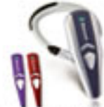
Headset HCB08 More Info >>