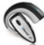
Headset HCB02 More Info >>