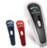
Headset HCB12 More Info >>