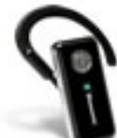
Headset HCB30 More Info >>