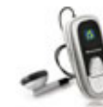
Headset HCB22 More Info >>