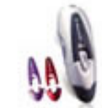
Headset HCB19 More Info >>