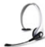
Headset HCB35 More Info >>